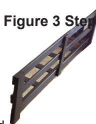
Figure 3 Step

Beds need a standard Twin or Full mattress.